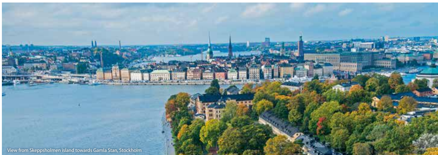
View from Skeppsholmen island towards Gamla Stan, Stockholm

Stockholm has a depth and vibrancy that enraptures and offers something for everyone. Between Stockholm and the coastal town of Trosa there are islands, quaint towns, nature reserves and verdant countryside to explore.