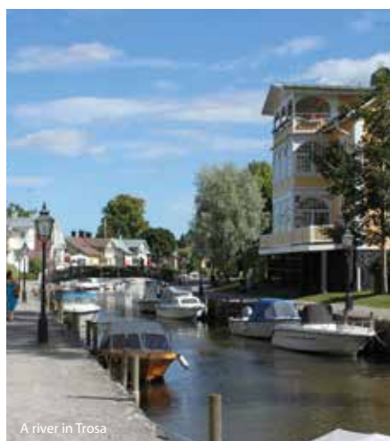
A river in Trosa