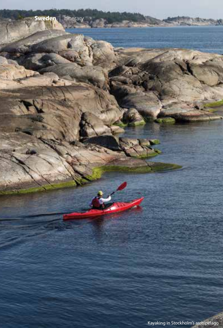
Kayaking in Stockholm's archipelago